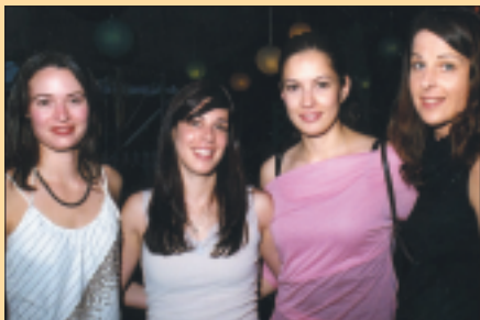
Young Philadelphians socialize during happy hour before the Harry Connick, Jr. concert.