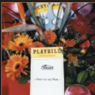
Each guest received the Party in the Park's very own Playbill .