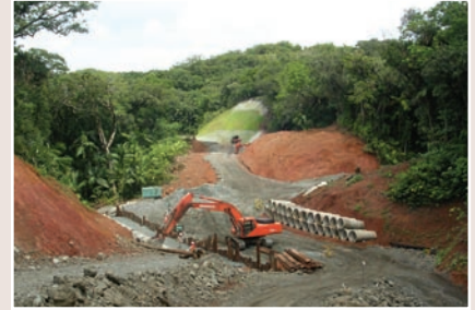
roadways and transportation