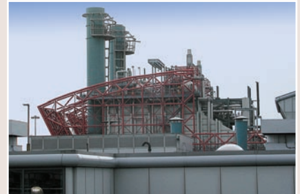
process and power plants