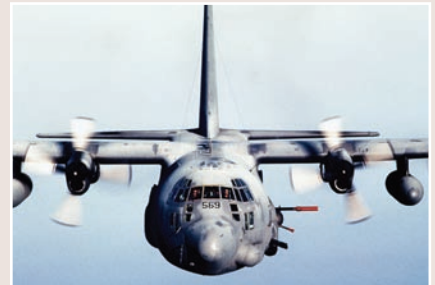
full-scale development and production