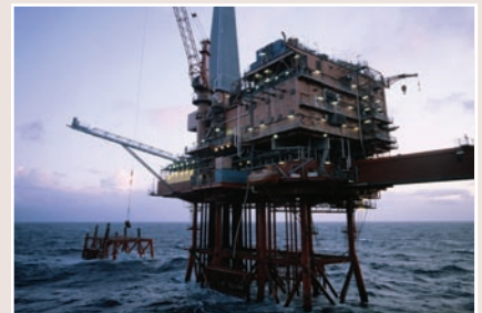
offshore and shipbuilding