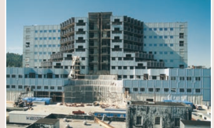
institutional and commercial buildings

For projects that are just getting underway, CPMI provides clients with comprehensive services to help keep construction on time and within budget. With extensive design/build experience, our team offers unsurpassed expertise in planning, budgeting, scheduling and many other areas crucial to efficient project management and sound technical decision-making. We've provided project control assistance in the building of airports, criminal justice facilities, hospitals, utilities, mass transit systems and more.